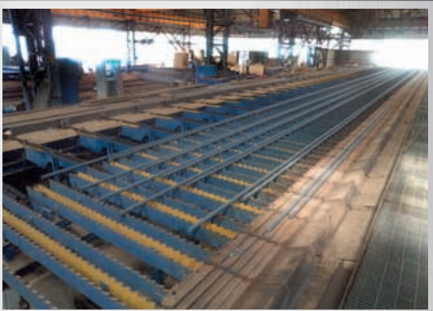
An overview of cooling bed of newly erected Rolling Mill.