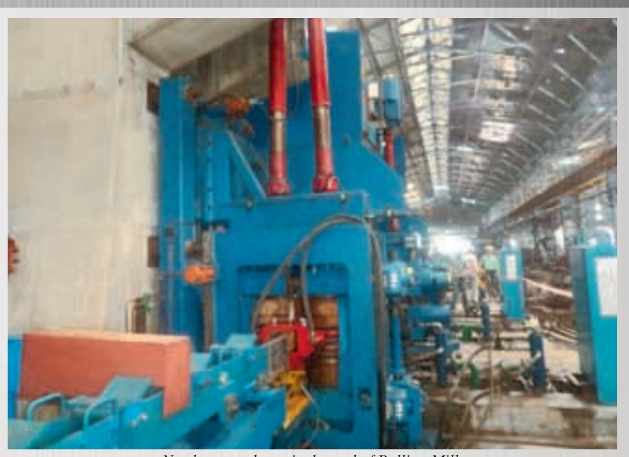
Newly erected vertical stand of Rolling Mill.